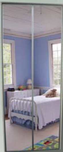
Bi Fold Doors Closed and open Shown with satin anodised frame

Bi-fold doors are an ideal option for storage cupboards or smaller wardrobes. Available with twin panel (as shown) or for larger openings quad panels with doors opening to the left and right.