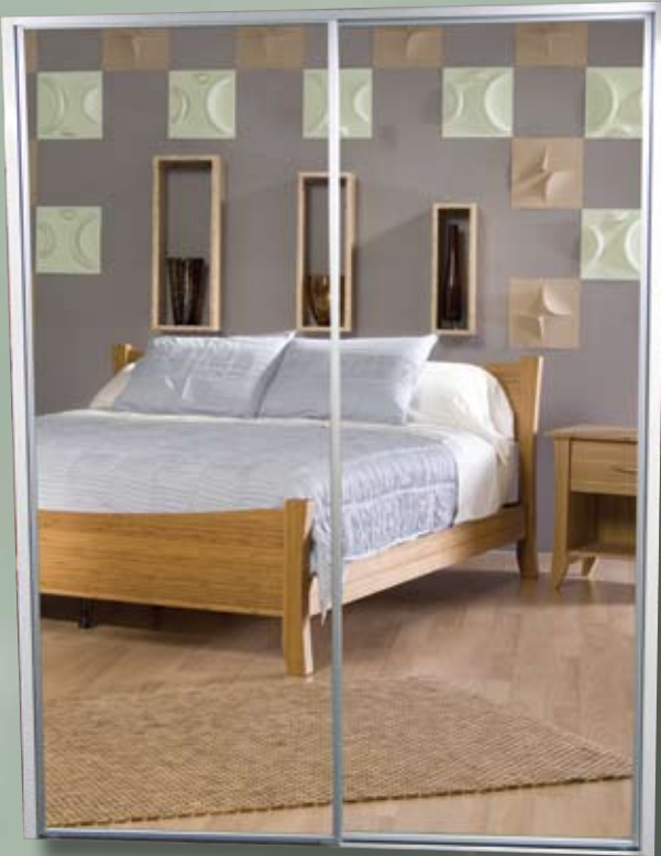
Double Panel Mirror Door Shown in satin anodised frame & mirror infill