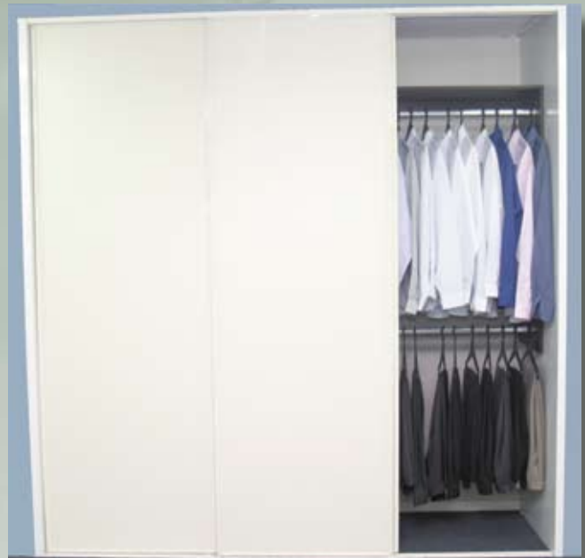
Triple Panel & Track Prefinished Board

Showerwell's sliding door system feature, smooth, effortless sliding motion and low profile, easy to clean V groove bottom track and gentle touch full height door buffer which protect the door panels and equally protect any painted wall surrounds from impact damaged.