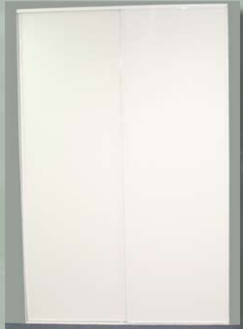
Double Panel & Track Prefinished Board

Showerwell's range of sliding & bi-fold doors are all custom made to suit, ensuring an optimum fit every time. All are manufacture with robust aluminium frames and tracks and a selection of popular prefinished board infill, safety backed mirror or gib board infill for those who wish to wall paper or paint a specific colour.